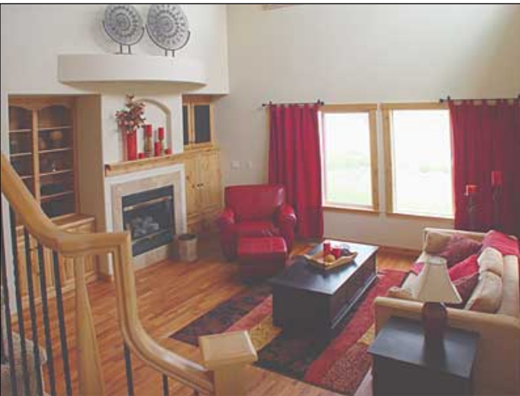
Cathedral/vaulted ceilings Gas fireplace Built-in entertainment center Central air conditioning