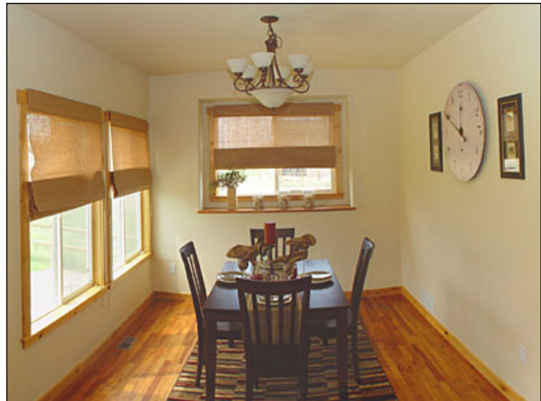
Dining room Built-in cherry shelf