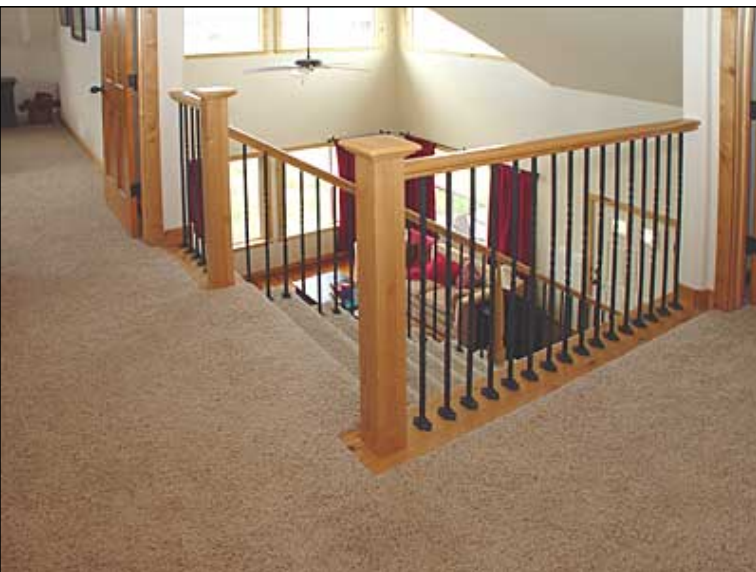
Iron spindled railing Ceiling fan