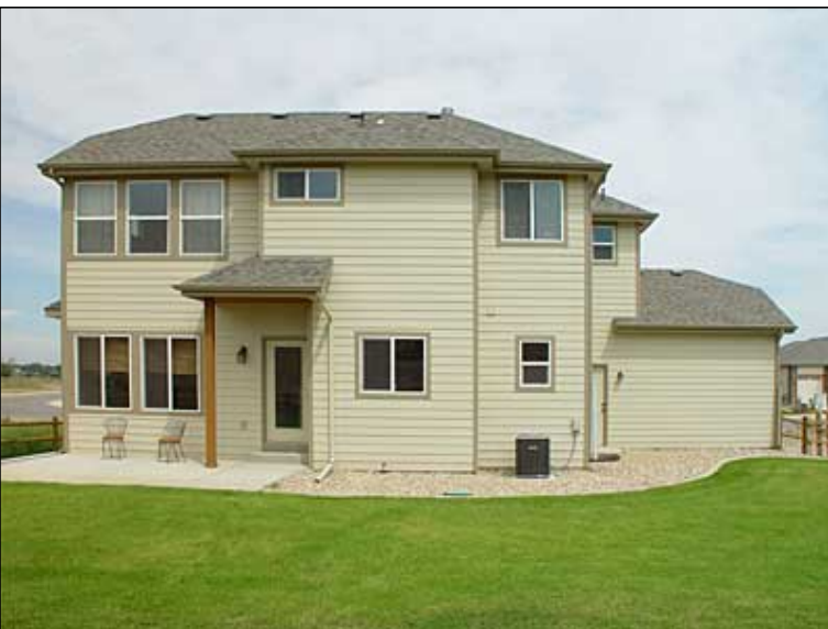
17x12 patio Large backyard