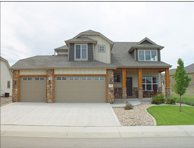
Oversized 3-car garage Garage door opener Covered front porch Level lot and drive