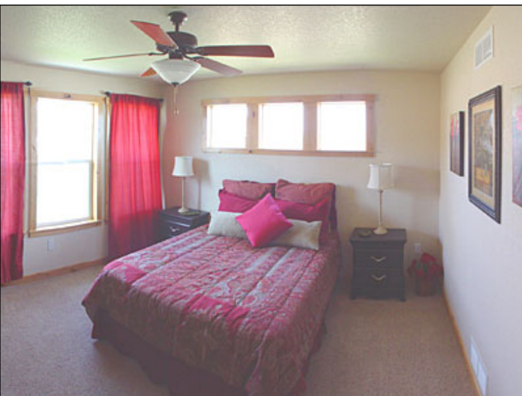
Walk-in master closet Ceiling fan Upgraded carpeting