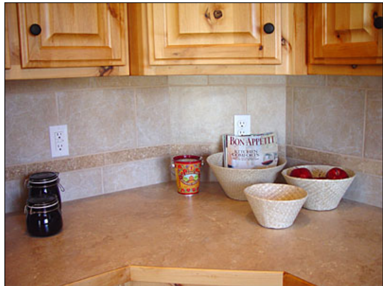
Ceramic tile backsplashes Matching counter top Electric self-cleaning oven Microwave