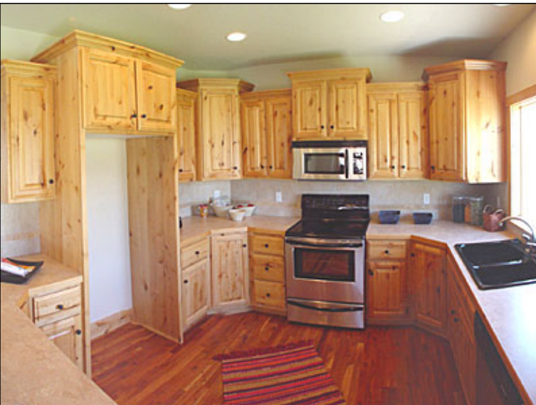
Corner pantry Stainless steel appliances Eat-in kitchen Dishwasher