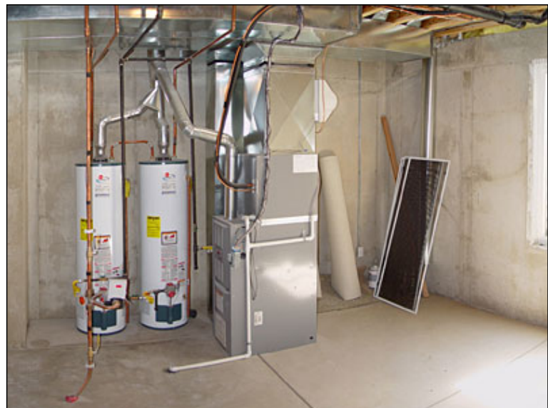
Unfinished basement 402 sq. ft. Forced air heating