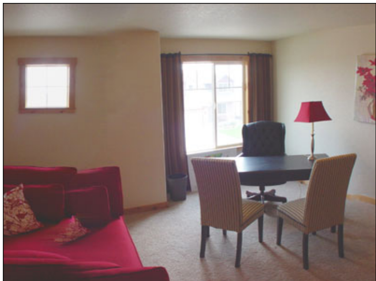
Office or 3rd bedroom Stain/natural trim

Please contact the builder for more information