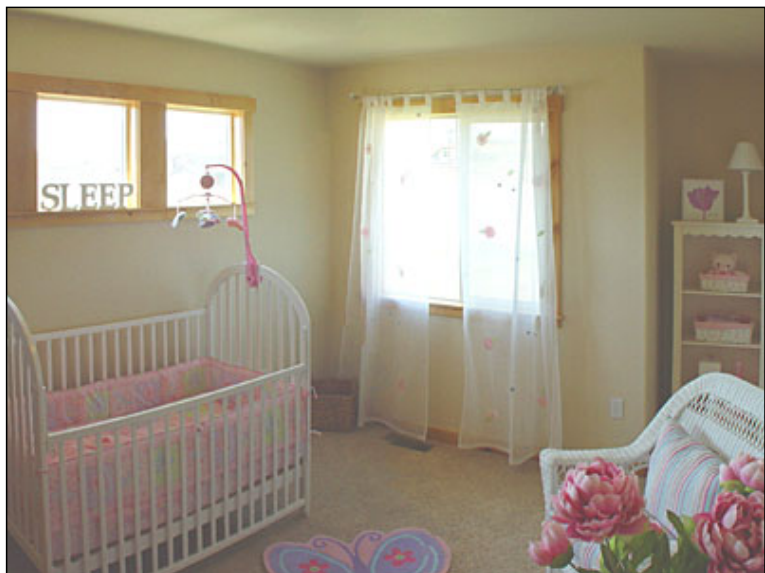
Nursery or 2nd bedroom Jack & Jill bathroom