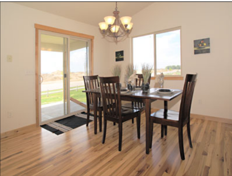
Dining room with hickory floors View of back and side yards Chandelier