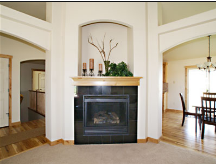
Living room Fireplace and mantle Decorative nook