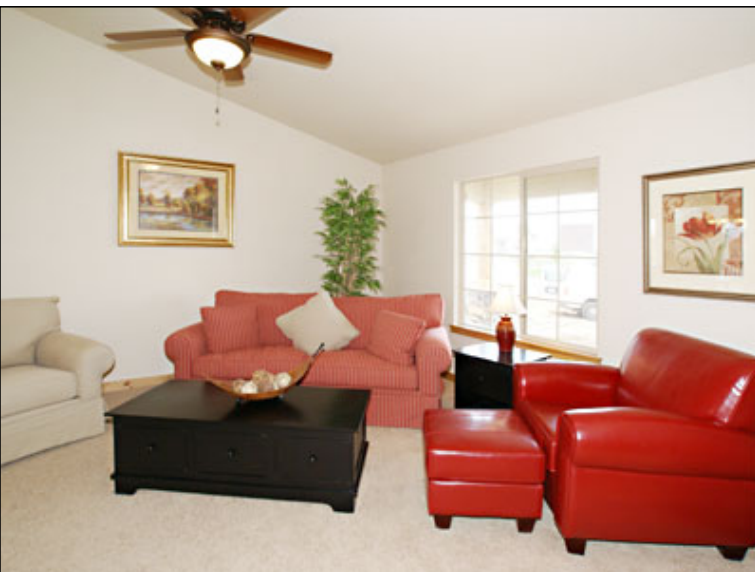
Living room with view of front yard Vaulted ceilings 2 Ceiling fans