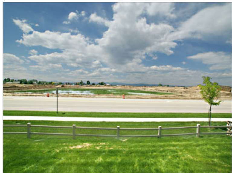
Backyard Fully landscaped