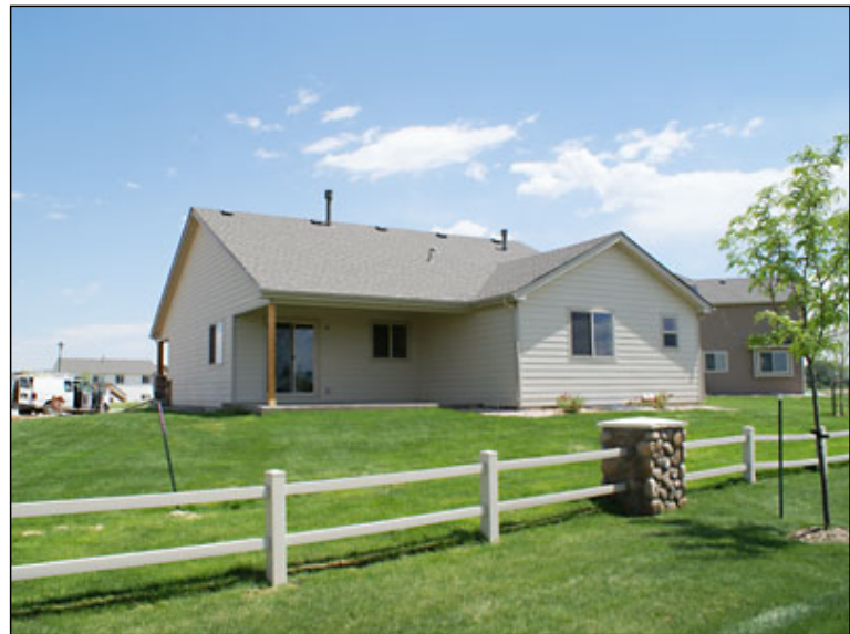
Backyard Fully landscaped