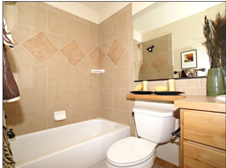
Master bath with shower and tub Tiled shower