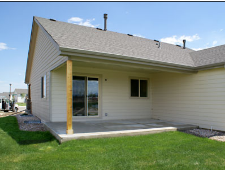
Covered backyard patio Accessible from dining room