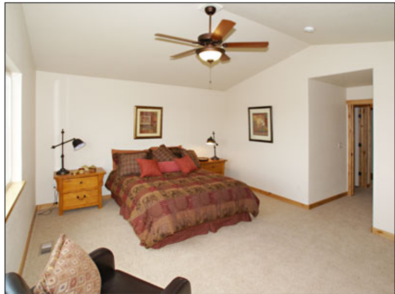
Master bedroom Ceiling fan