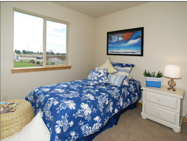
Bedroom #2 View of side yard