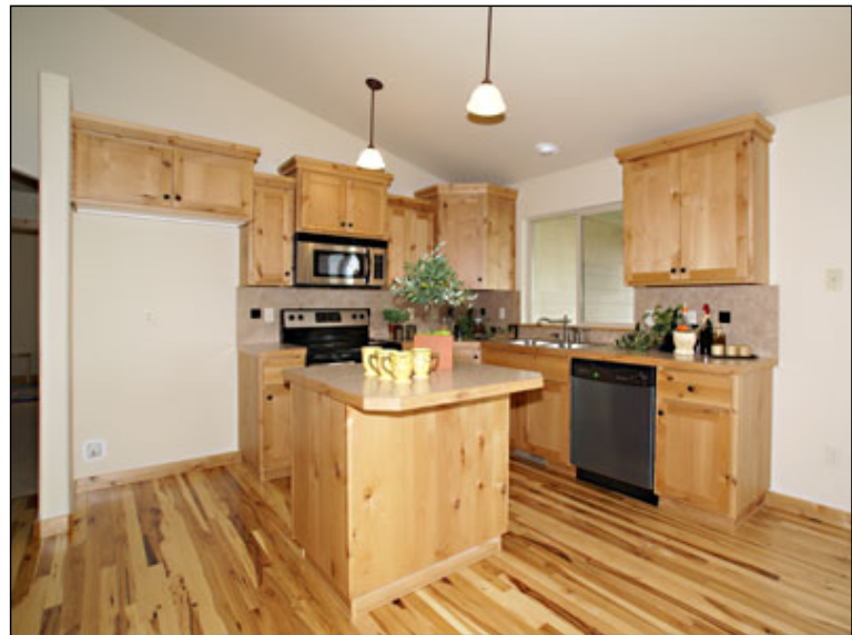
Kitchen with island Vaulted ceilings 2 Ceiling fans