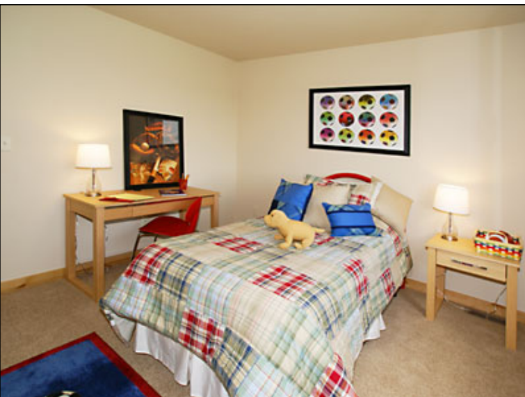
Bedroom #3 View of side yard